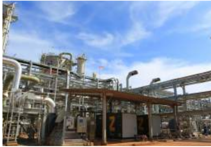
Image source - energyworld.com - Mengetahui Sejarah Daring - Matindok Sulawesi Tengah

Name of Project : Matindok Gas Development Project End User Supply : Pertamina EP Project : Oil & Gas Years of Supply : 2015 Location : Sulawesi